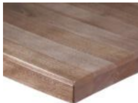
#9: 1/2" CHAMFER