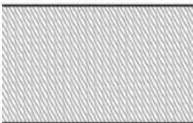
#10: 1/2" ROUND

Custom stain finishes are also available