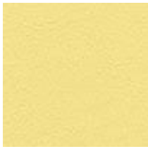
25 First Light