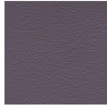
33 Wood Violet