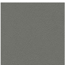
21 Dk. Pewter