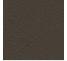
08 Baja Brown